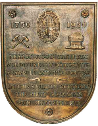
Nearby stood the first structures in Dartmouth, a sawmill and guardhouse. In this vicinity occurred the first massacre 30th September 1749.

As Martin notes by the fall of 1750 the town site had been laid out, “...comprised of 11 oblong-shaped blocks, mostly 400 by 200 feet... (with) each building lot 50 by 100 feet...” (184 lots) encompassing an